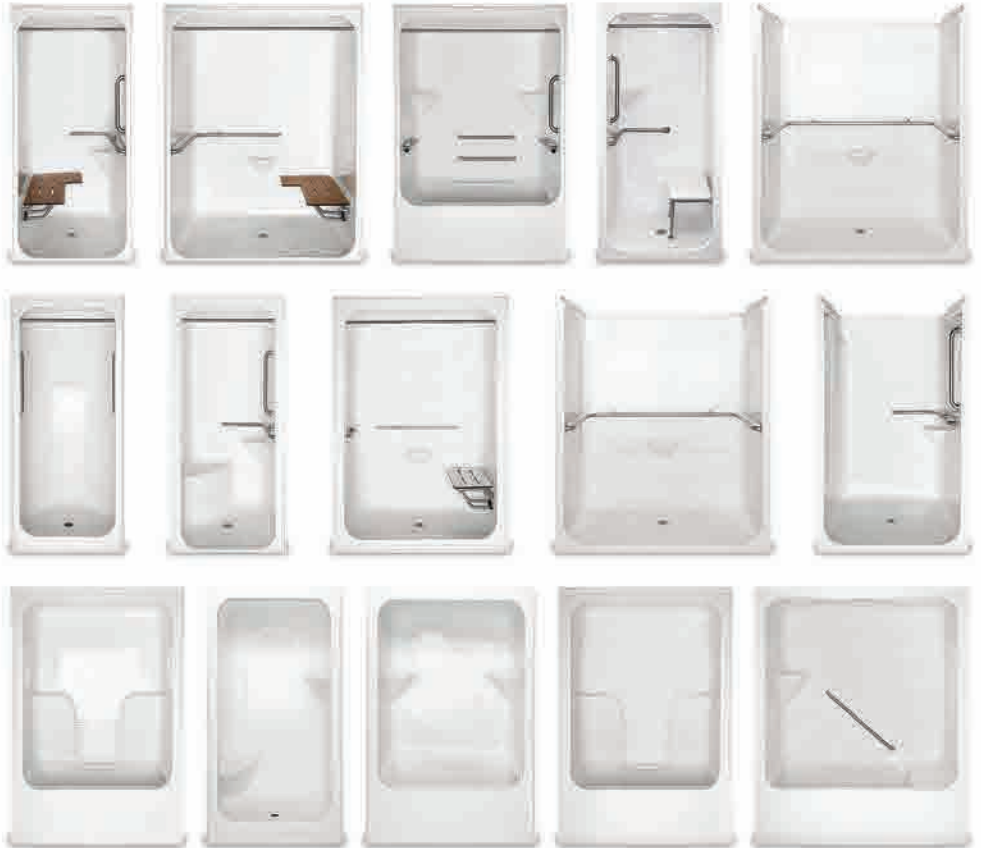
Larger Showers Will Accommodate a Wheelchair or Shower Chair

Aqua Bath fully supports the Buy American Compliancy Act and American Recovery and Reinvestment Act (ARRA) USC section 1605.